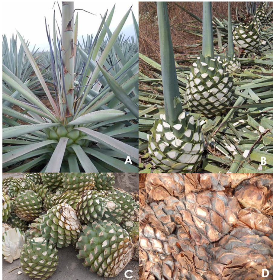
Figure 1. A) Mature Agave angustifolia Haw. suitable for processing. B) Removing the leaves to obtain "piña". C) "piñas" before baking. D) "piñas" baked.

The three materials with 0, 90 and 180 days of aging were exposed to a composting process which consisted in moving and moistening every 105 days the material as it was proposed by Íñiguez et al. (2011). The internal temperature of the piles was monitored every seven days using nine dial thermometers of 13 centimeters of diameter with a stick of 60 centimeters of length (three per pile).