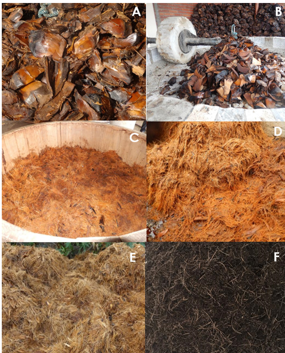
Figure 2. A) "piña" broken after baking. B) The piñas are grinded with stone wheel pulled by a horse or mule. C) Fermentation of agave for produce mezcal. D) Agave waste after fermentation and distillation yields, bagasse with 0 days of aging. E) Bagasse of 90 or 180 days of aging. F) compost bagasse.

with the neutral detergent fiber (NDF), acid detergent fiber (ADF), and acid lignin detergent (ALD), according to the technique described by Georing and Van Soest (1970). The content of hemicellulose was calculated by the difference of the (ADF) and (NDF). The loss of organic matter (OM), TOC and nitrogen were calculated according to the equations established by Íñiguez et al. (2006), and field density was determined by the TMECC (2001) technique.