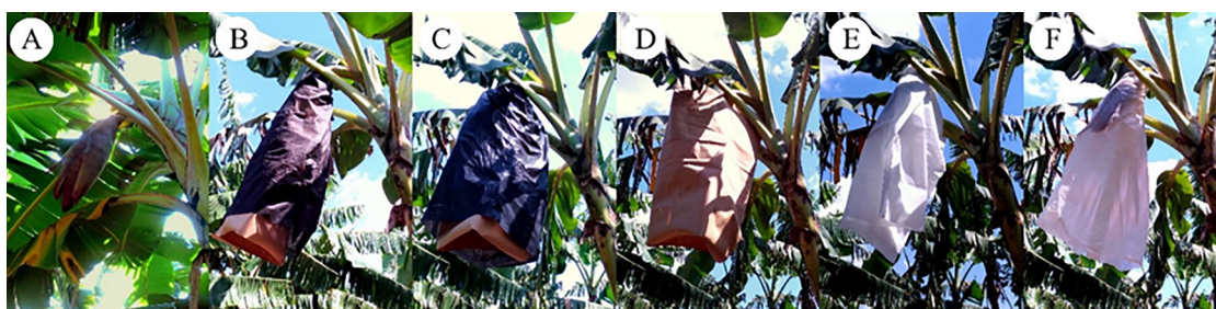
Figure 2. Inflorescence without bagging (A) and with polypropylene black bag (TNT) + kraft paper (B); polyethylene black bag + kraft paper (C); kraft paper (D); polypropylene white bag (E) and polyethylene white bag (F).

The bags that composed the treatments were: WB – without bagging (Figure 2A); BBTk – polypropylene black bag (TNT) + kraft paper (Figure 2B); BBPK – polyethylene black bag + kraft paper (Figure 2C); KP – kraft paper (Figure 2D); WBT – non-woven polypropylene white bag (TNT) (Figure 2E) and WBP – polyethylene plastic white bag (Figure 2F).